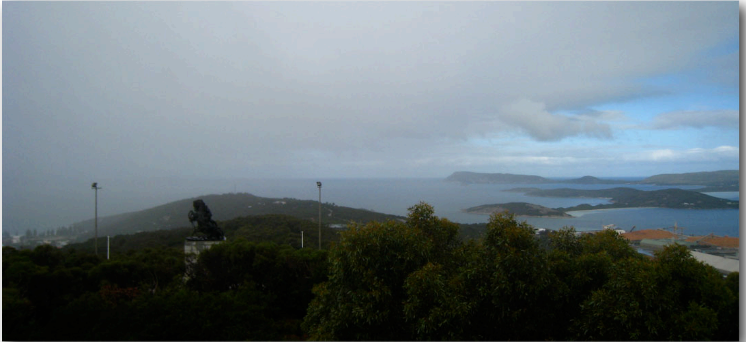
Typical Albany: sunshowers.