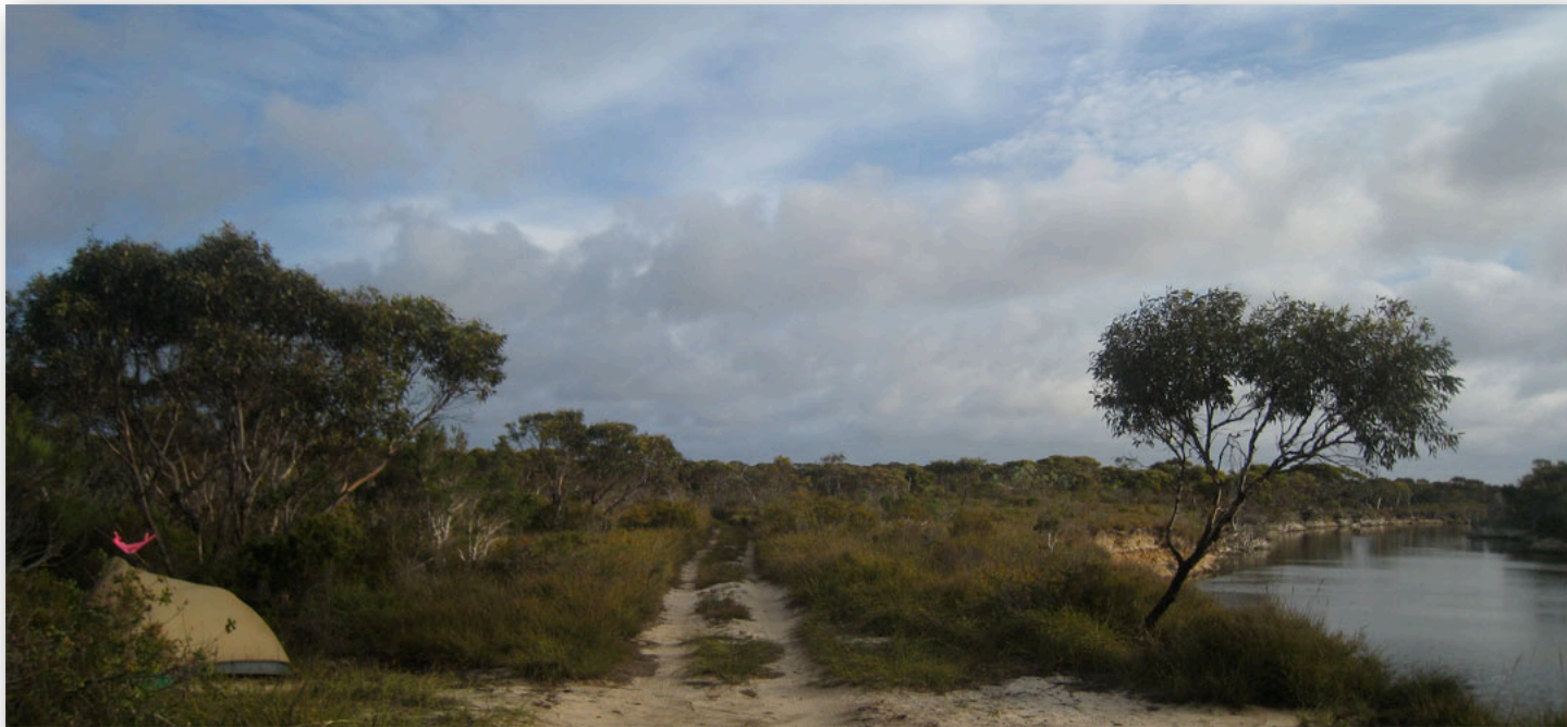
Camping at quiet Munglinup Inlet.