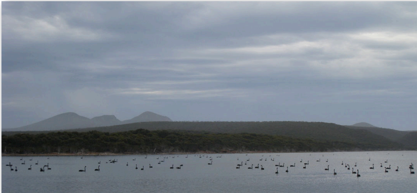
Swan Lake down at Hamersley Inlet. Nice.