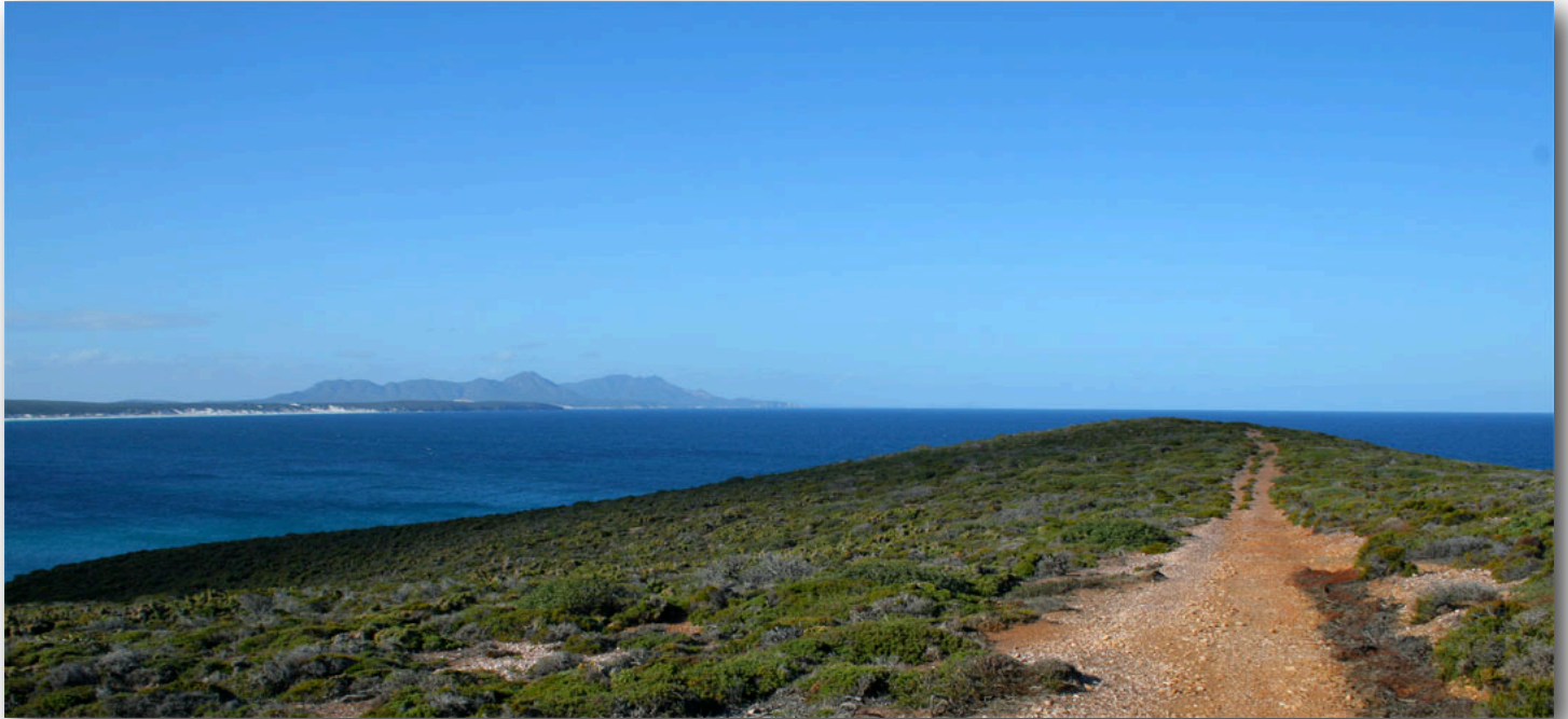
Down at Point Ann, FRNP.