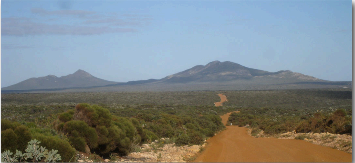
Leaving Point Ann on the way to Bremer Bay. West FRNP.