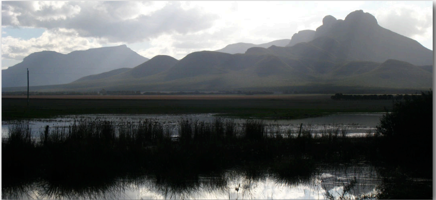
Stirling Range in SRNP.