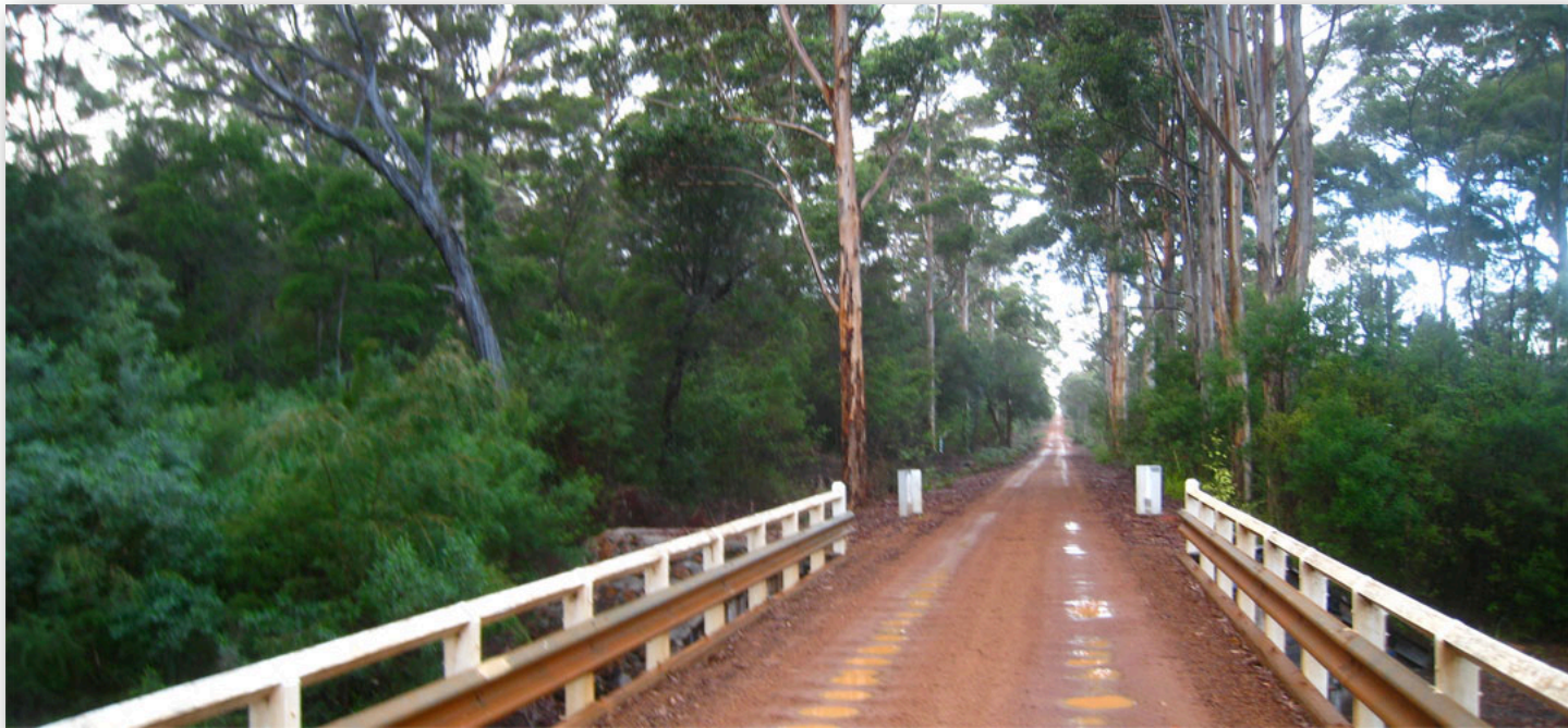
Off on another back road, Chesapeake Road, on the way to Northcliffe.