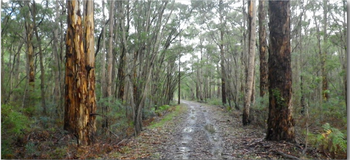
Last bit of off road for a while, the Coweramup Rail Trail.