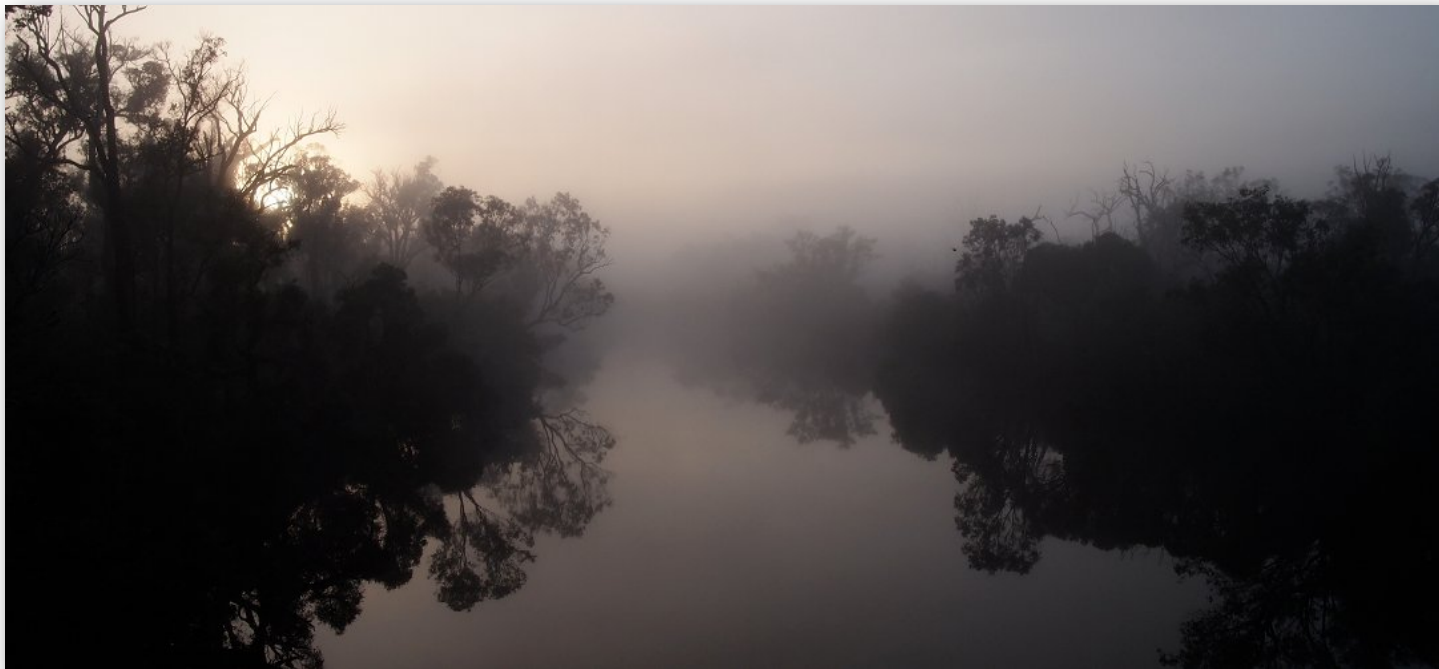
Early morning fog at the Frankland River.