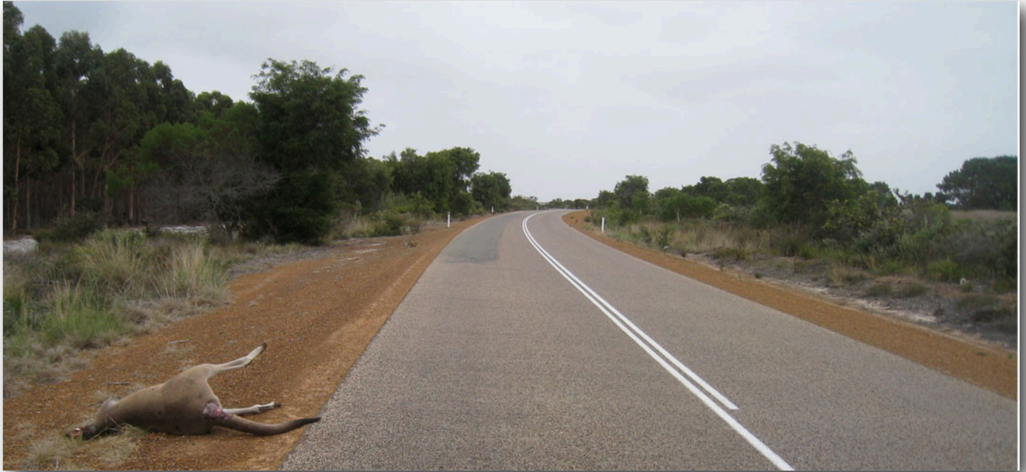
Outta Bremer Bay.