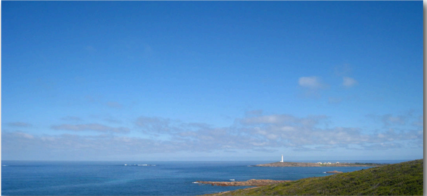
Cape Leeuwin and Australia's tallest lighthouse.