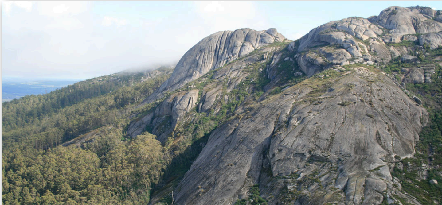
Wandering in the Porongarup National Park.